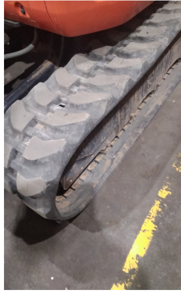
Tyre Condition 1