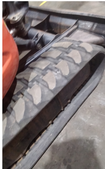
Tyre Condition 3