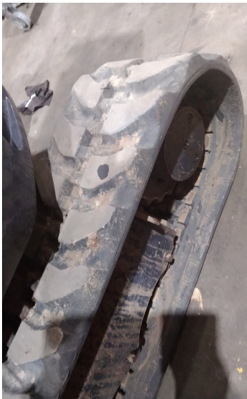
Tyre Condition 2